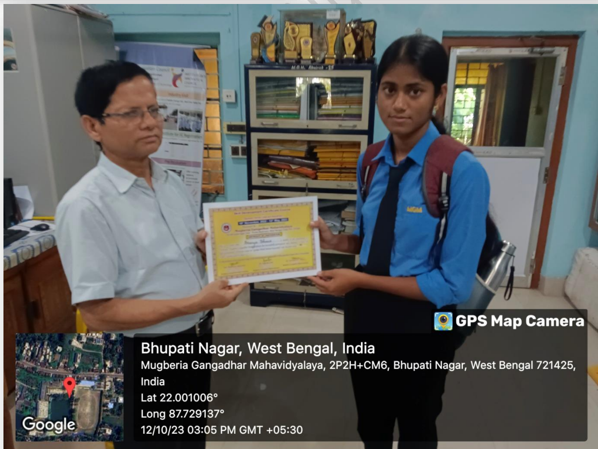
Students receiving certificates form Principal